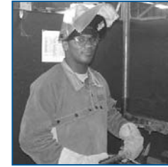
Trade School Students