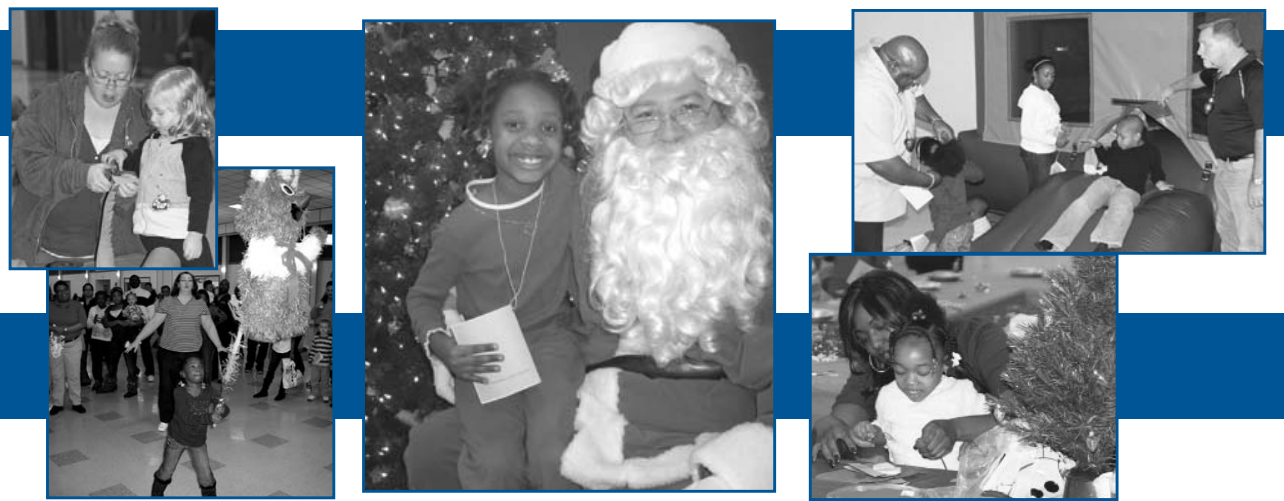
UFCW Locals 876 and 951 hosted a Holiday Celebration for members and their families featuring the traditions of Christmas, Kwanza, Hanukkah and Diwali. Over 350 participants enjoyed, photographs with Santa, kid’s crafts and other activities, hot dogs and snacks, and an African storyteller. The event also generated nearly $1,000 for Michigan Food Banks.